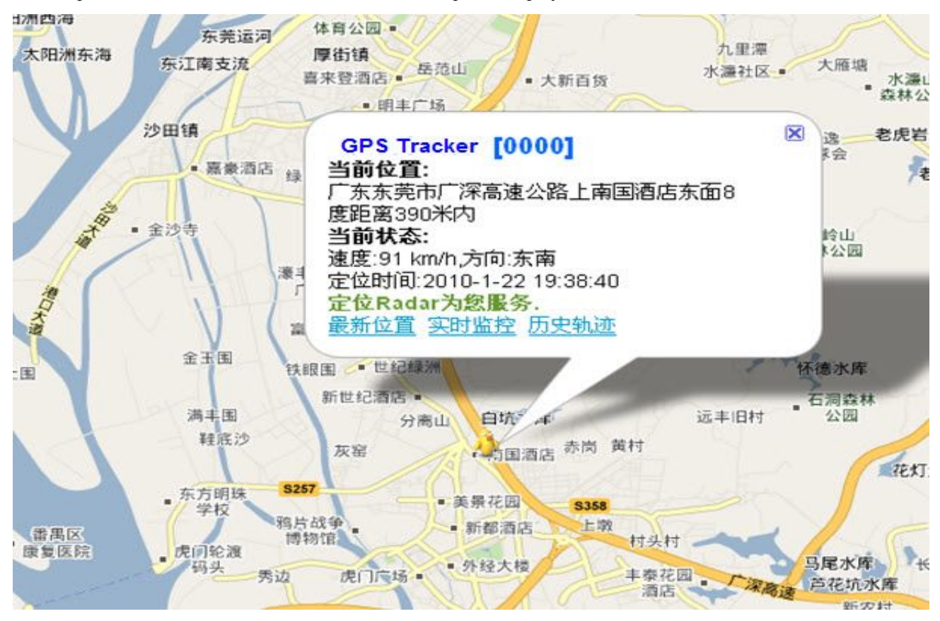
Step 2: Click the terminal of the ward, then the map will display the location of the ward.

Step 1: Log onto the platform: JK.JY100.COM